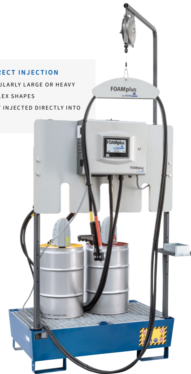
FOAMplus® Hand Packer 2 Stand Version