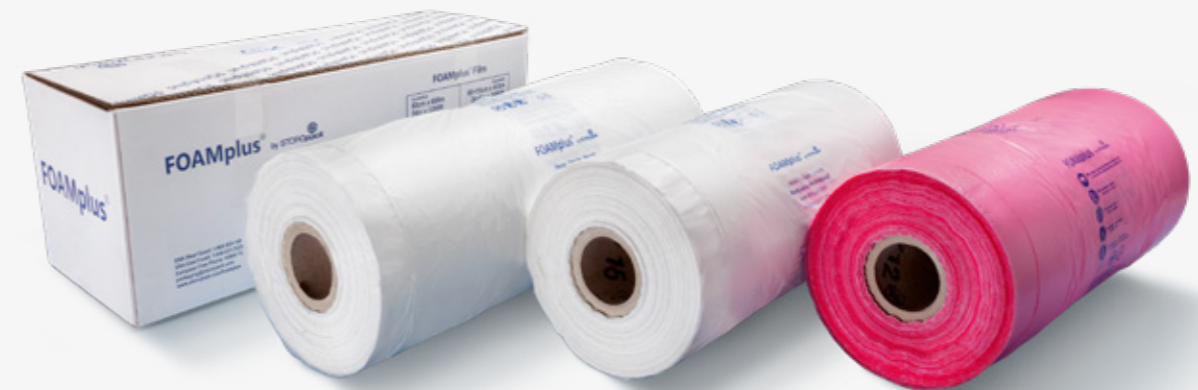
The safe and durable option: FOAMplus® films