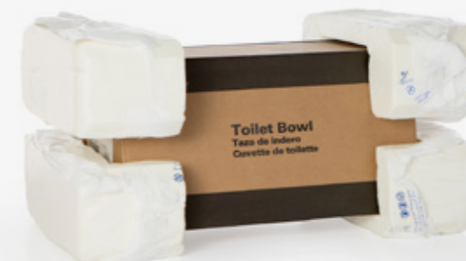
The fast solution for molded protective packaging: FOAMplus® Premold