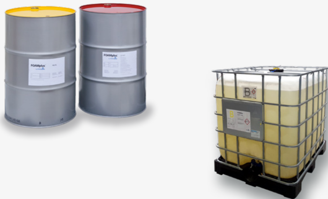
The ideal solution for any demand: FOAMplus® metal drums and containers