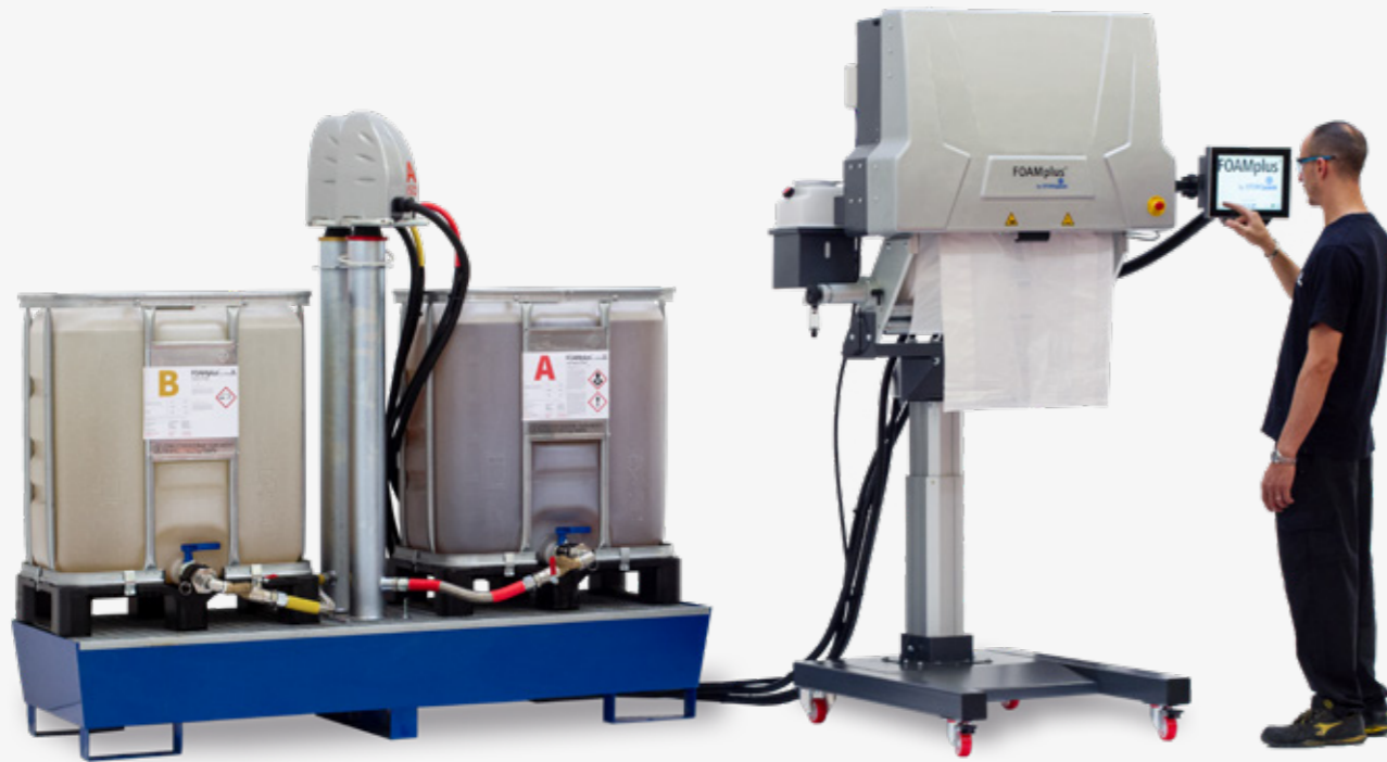
Efficient packaging for high throughput applications: FOAMplus® Remote Batcher System with FOAMplus® Bag Packer 2