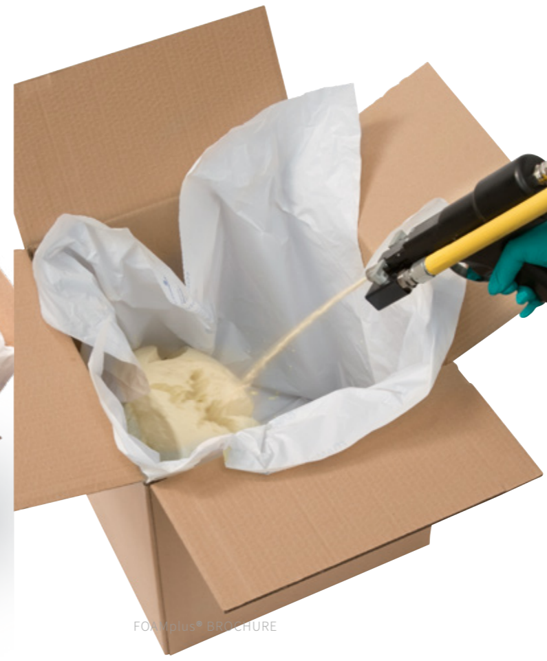
FOAMplus® Direct Injection