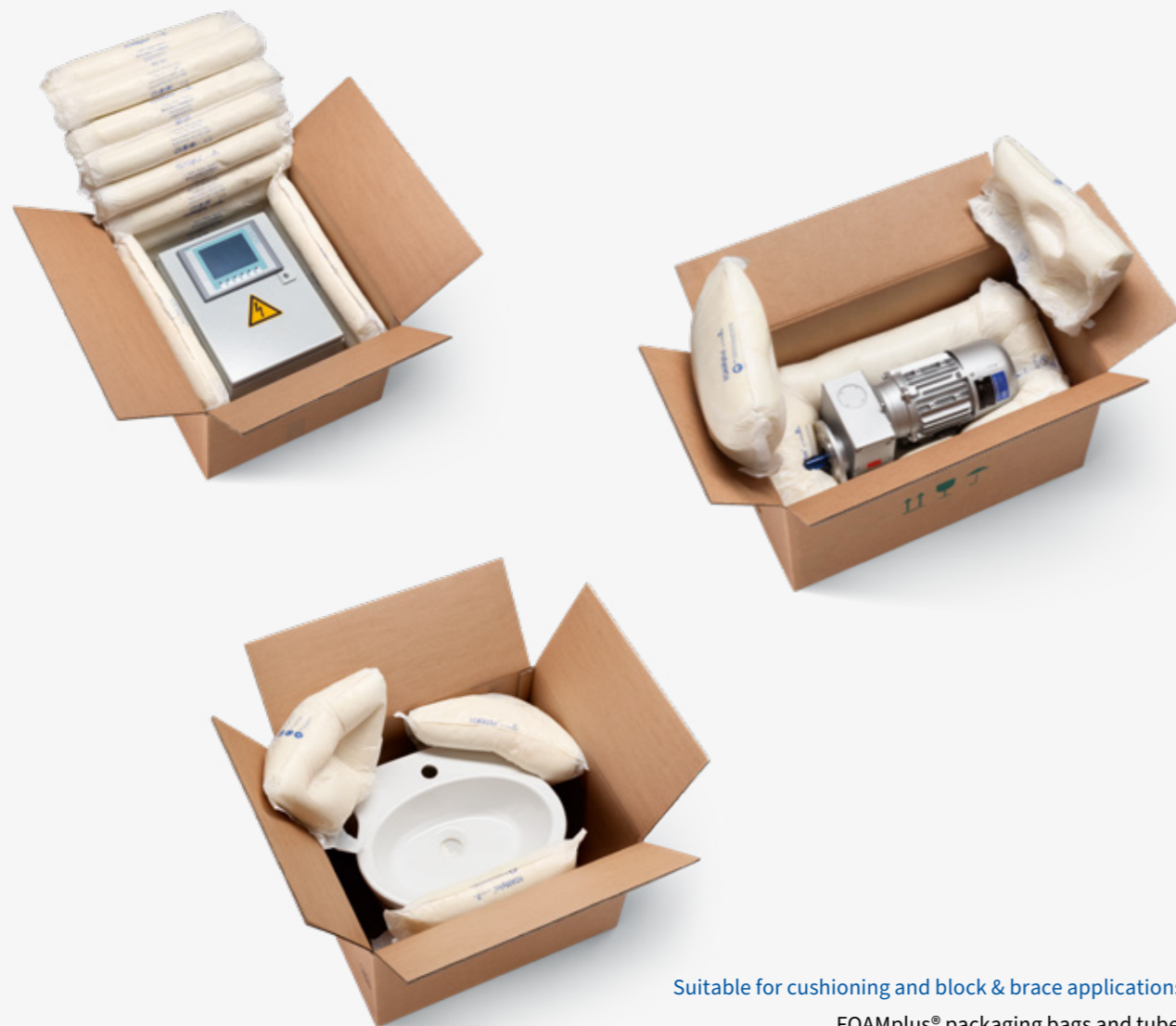
Suitable for cushioning and block & brace applications: FOAMplus® packaging bags and tubes

shape in seconds, and affords the highest degree of protection against shock, vibration and compaction. A robust solution for goods in transit and storage that ensures products arrive in perfect condition. Thanks to its low weight, it also reduces transport costs whether it's fragile ceramics, bulky bicycles or heavy furniture.