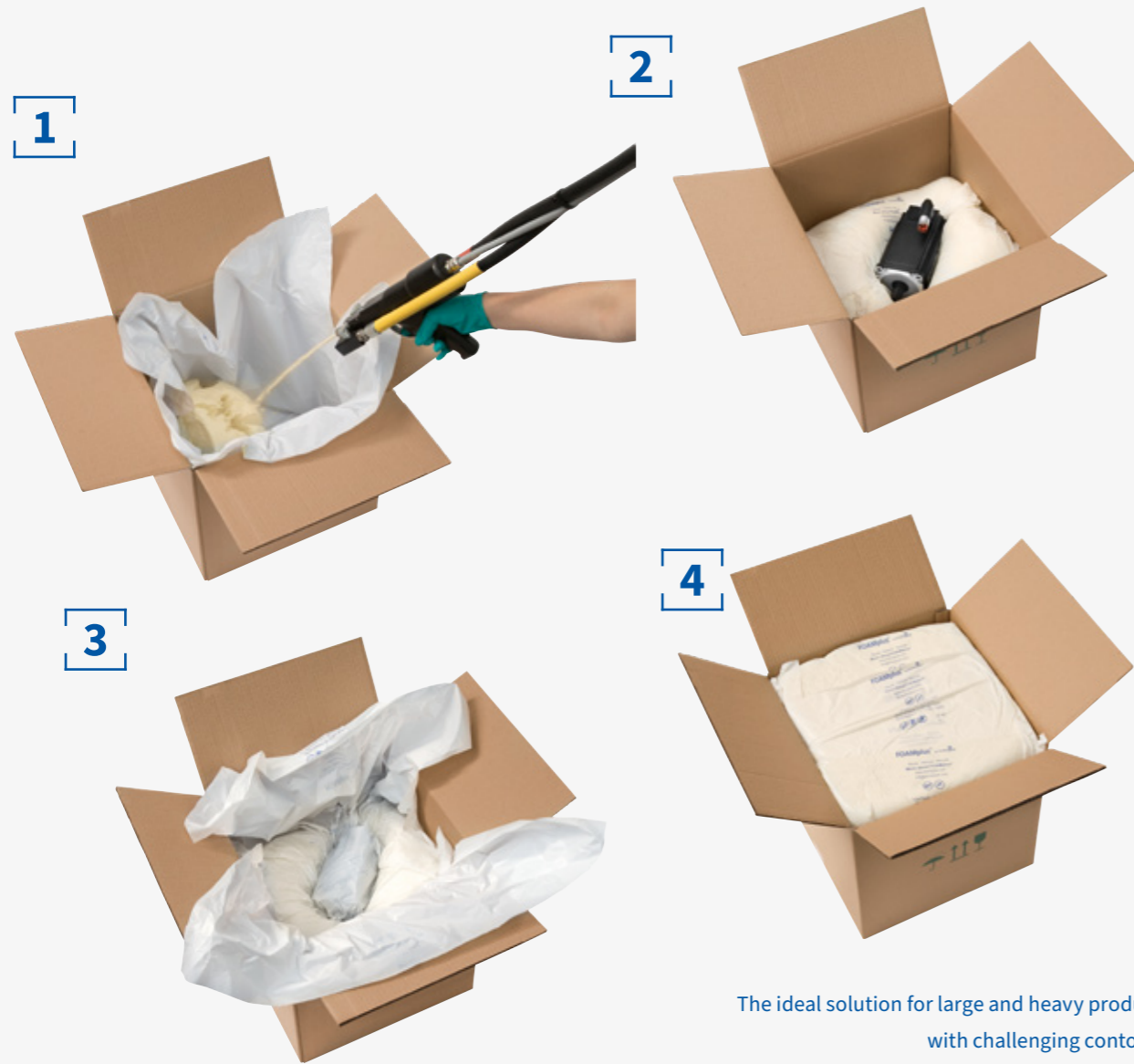
The ideal solution for large and heavy products with challenging contours: FOAMplus® Hand Packer 2 for direct injection